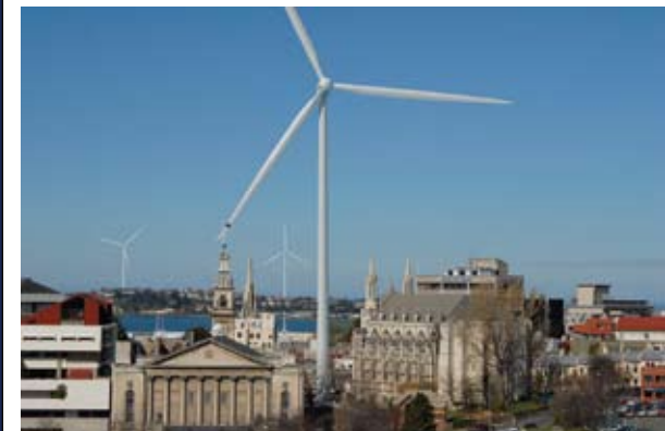
3.6 MW turbine (160 m high) superimposed over a photograph of Dunedin's Octagon with further 3.6 MW turbines on the ridge in background