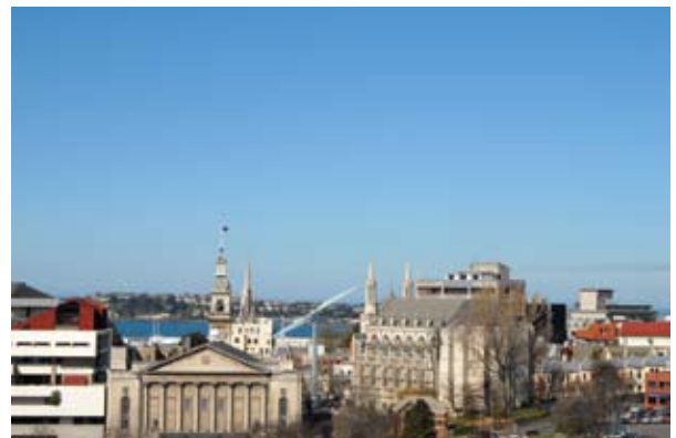
Windflow 500 (47 m high) superimposed over a photograph of Dunedin's Octagon with further Windflow 500 turbines on the ridge in background